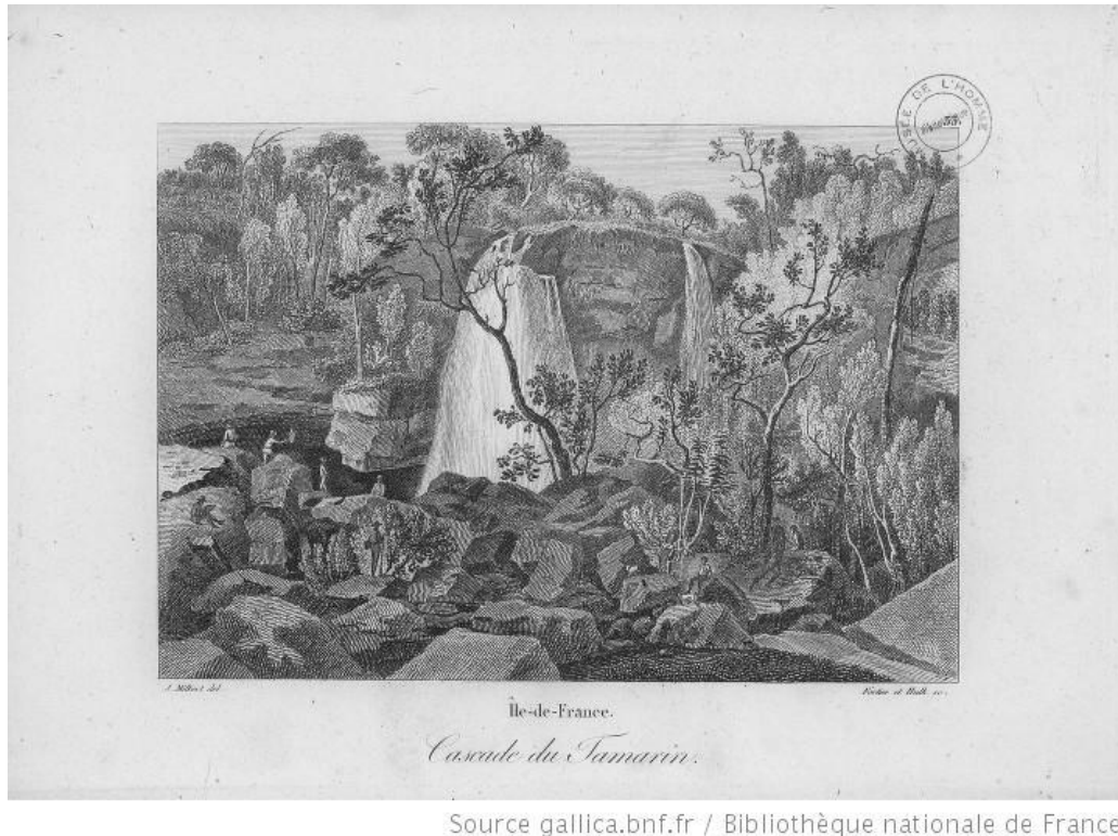
Figure 3. Jacques-Gérard Milbert, Illustrations de voyage pittoresque à l'Île de France , 1812. Cascade des Tamarins, with 'the great stones which cover the ground', and their 'sharp edges'.

Consequently, Flinders's interpretation of the geology of Île de France highlights how geological theories that divided scientists in both England and France had circulated among the European educated classes, and encouraged them to construct a geological history of the Earth through the observation and classification of its rocks.