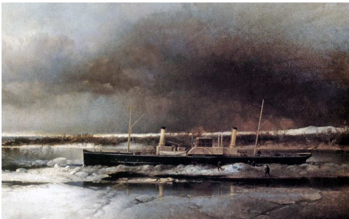
Figure 5. The paddle-steamer Dallmann on the Yenisey