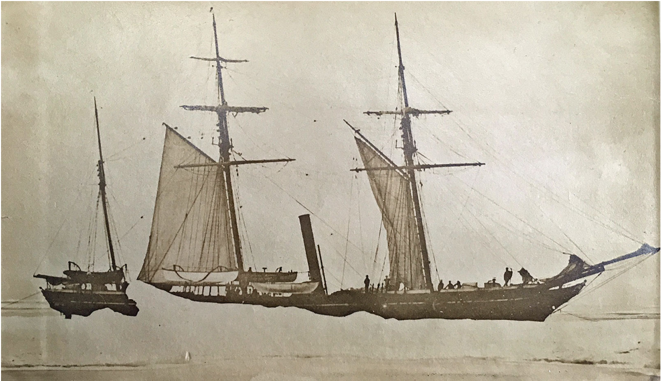
Fig. 2. The Pandora in ice during the 1875 voyage.