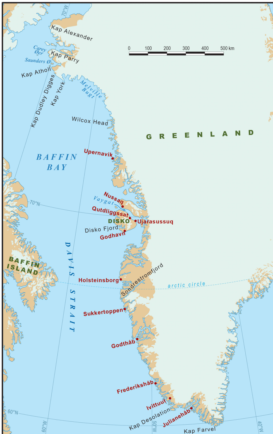
Map 1. The west coast of Greenland traversed by Pandora in both 1875 and 1876.