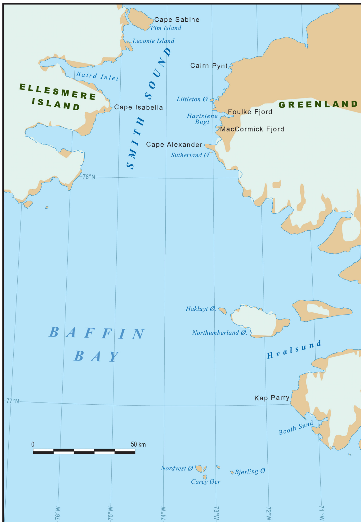
Map 3. Northern Baffin Bay and Smith Sound visited by Pandora in both 1875 and 1876.